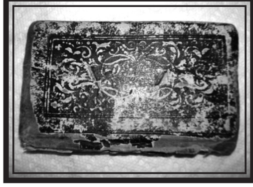
Small diary in the pocket of Thomas Normington's vest